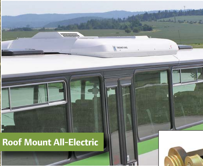
Roof Mount All-Electric