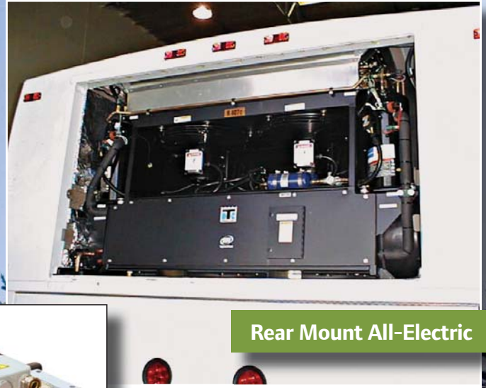
Rear Mount All-Electric